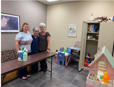
Cleaning visiting rooms