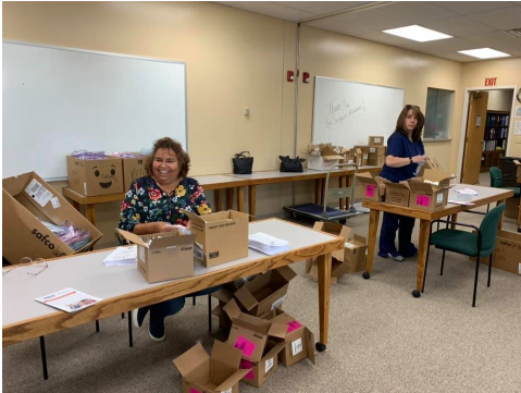
Filling dental kits

Each year Eye Surgeons Associates employees choose a non-profit to benefit, and this year they chose Bethany. ESA helped the agency in a variety of ways throughout the year, including sponsoring our Community Celebration, hosting a number of employee fundraisers, volunteering to clean visiting rooms, and putting dental bags together at the agency. Thank you for thinking of Bethany, Eye Surgeons Associates! Your gifts have made an impact and helped us advance our mission.