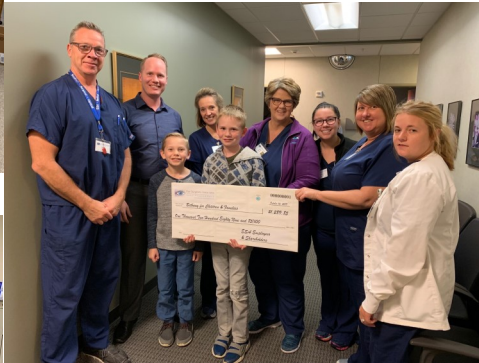
ESA staff presenting the results of their fundraising