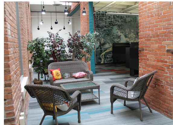
A sitting area for staff to work together or relax while on break.