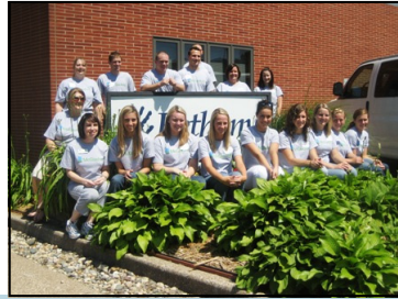
The McGladrey group poses for a photo in front of the Bethany sign.

Thank you to students and staff from the Pathways Program at McGladrey for shampooing carpets in Bethany's Moline office on Wednesday, June 29. The volunteers also spent the afternoon washing toys, basketballs, and transported donated mattresses.