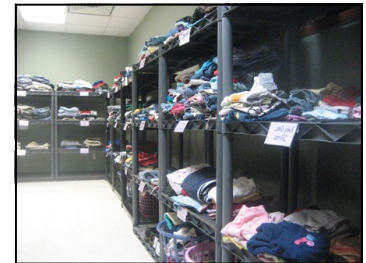
One of the many shelves of men's, women's, and children's clothing in the pantry.

Have your children grown out of their summer clothes already? Is it time to clean out your closet to prepare for cooler weather? Don't forget about Bethany's clothing pantry located in the lower level of the Davenport office at 1202 W. Third Street. Donations of clean and gently used clothing are welcome between 9:00 a.m. and 4:00 p.m. Monday through Friday.