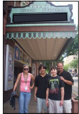
Staff and students stand outside Circa '21 Dinner Playhouse.

Additionally, the group went to Circa '21 Dinner Playhouse and saw the play "If You Give a Mouse a Cookie." The kids really enjoyed the show, something they may not have been able to experience outside of this program. Thank you to Circa '21 for the discounted tickets!