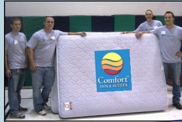
Four students from the Pathways Program at McGladrey hauled the mattresses and box springs to Bethany's Moline office.

Thank you to Comfort Inn & Suites of LeClaire, Iowa, for donating over 11 queen size mattresses and box springs to Bethany's Family Furniture Assistance program! The beds were given to families in the Quad Cities.