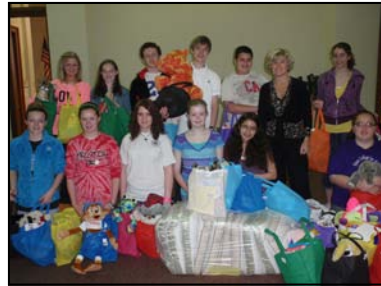
Students in the People to People Ambassador program present the foster care bags to Bethany.

The Quad Cities Junior High Group of People-to-People Student Ambassador International Program collected items and filled more than 50 foster bags for Bethany's Foster Care Program. The People-to-People group will take a 20-day educational trip to Italy, France, Austria, and Switzerland in June.